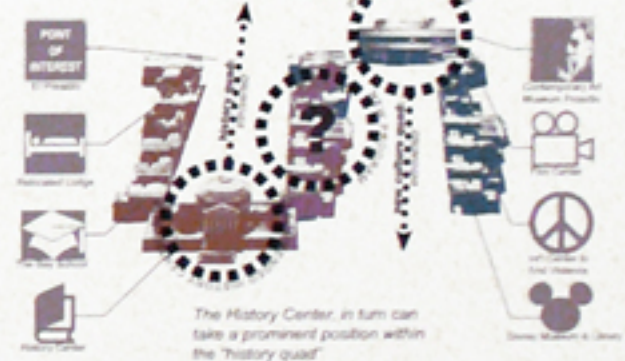
The History Center, in turn, can take a prominent position within the "history quad"

By redefining the context, CAMP should remain in its proposed site as a key player in this re-vised master plan