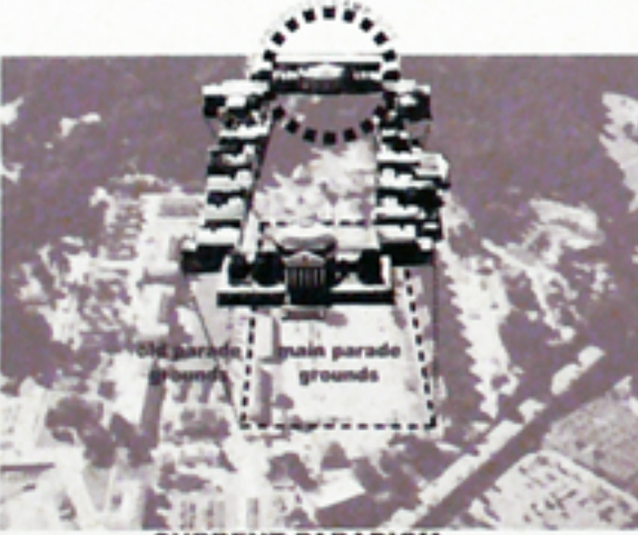
CURRENT PARADIGM The current planning paradigm for the Presidio's Main Parade Grounds finds an analogy in Thomas Jefferson's design for the University of Virginia, a neo-classical campus layout that puts great importance on each end of the primary axis.

Based on current paradigm, the proposed Contemporary Art Museum Presidio (CAMP) site is disproportionately prominent SOLUTION alter the paradigm